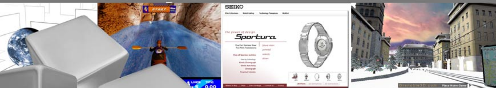
Golden Polygon 2003 Winners : Arte, Kellogs, Seiko, Grenoble

Audience of the Golden Polygon : Professionals of 3D, 3D Studios, Marketing & web agencies, Industry (CAD), students.... The jury is made of professionals of 3D (3D internet sites chief redactors, R&D, specialist of 3D...).